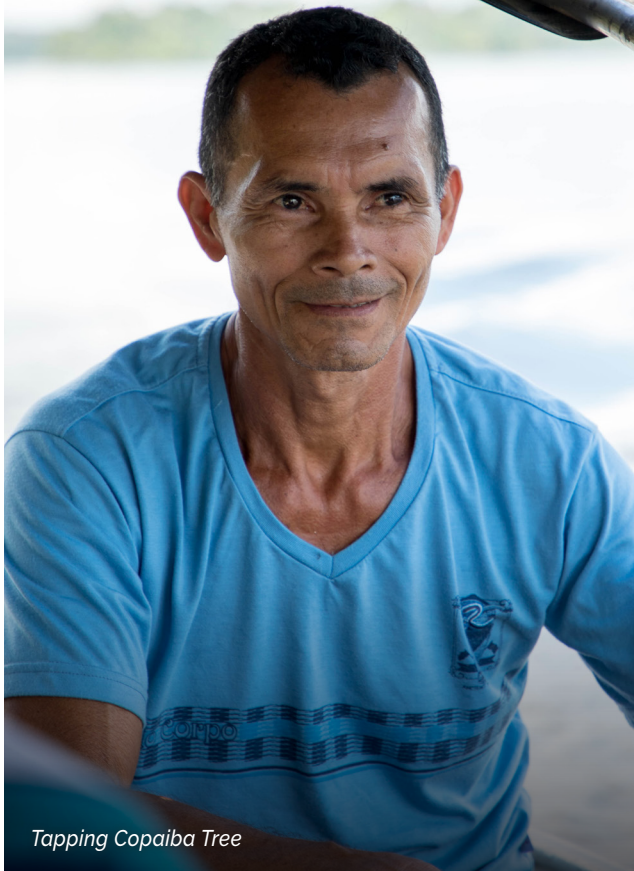
Tapping Copaiba Tree

dōTERRA sourcing partners work with harvesting families who live along the Amazon River to produce Copaiba essential oil. Each family cares for several trees—a tradition that's been fostered for generations.